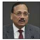
incorporated into the Constitution of India. "Speaking about AI, the CJ said that reports have started coming that the technology also discriminates and is sometimes biased. Recalling his childhood days, the CJ said that his family

NEW DELHI, MAY 6: Chief Justice of India Surya Kant on Wednesday said despite its growing influence, artificial intelligence is showing inherent bias against the poor, and stressed that social justice remains the cornerstone of a humane and equitable society. Speaking at the 8th Dinkar Memorial Lecture on "Rashmiration: The Epic of Social Justice" organised by NGO Respect India, CJ Kant said the ideals of equality and human dignity were powerfully echoed in the works of Ramdhari Singh Dinkar, long before they were