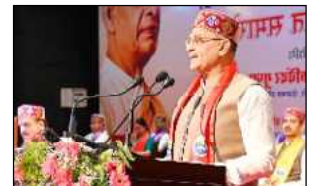
India. Presiding over the Convocation ceremony held in the historic town widely known as 'Choti Kashi', the Governor described the event as far more than a mere degree-giving exercise - calling it a celebration of the confluence of knowledge, culture, and responsibility." The Governor conferred 41 Gold Medals and 304

Governor presides over 2nd Convocation of Sardar Patel University Mandi MANDI, MAY 6: The Governor of Himachal Pradesh, Kavinder Gupta on Wednesday addressed the Second Convocation of Sardar Patel University (SPU), Mandi, exhorting the graduating class to transcend individual careers and dedicate their knowledge, innovation, and moral sensibility to the collective mission of building a strong, self-reliant