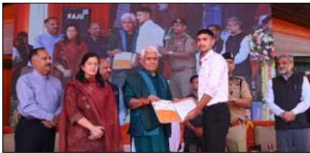
several development projects. These include establishment of Digital Library at Government Primary School, Regal, construction of Community Hall cum Recreation Centre at Regal, development of Amrit Sarovar at Regal alongwith Drainage Channel, Installation of 03

JAMMU, MAY 6: "Our border villages are the inheritors of a rich tradition of courage and resilience. Under the leadership of Prime Minister Narendra Modi, we have shifted the narrative. These are no longer the 'last villages' of India; they are our 'First Villages,'" the Lieutenant Governor Manoj Sinha said on Wednesday. The Lieutenant Governor was addressing a public rally during his visit to the border village of Regal in the Samba district today, where he initiated and laid the foundation stone for