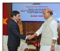
NEW DELHI, MAY 6: Defence Minister Rajnath Singh held bilateral talks with Vietnam's Deputy Prime Minister and Minister of National Defence Phan Van Giang in New Delhi on Wednesday, with both sides reviewing ongoing defence cooperation and agreeing to further deepen strategic ties. The meeting reflected the growing strategic trust between India and Vietnam under their Enhanced Comprehensive Strategic Partnership. In a post on X, Rajnath Singh said he had an excellent meeting with General Phan Van Giang and noted that India values its long-standing ties with Vietnam. He said the discussions focused on adding greater momentum to defence cooperation and expressed

confidence that recent developments reflected positive progress in bilateral engagement. During the discussions, the two leaders reviewed progress in bilateral defence engagements, including high-level exchanges, training programmes and capacity-building initiatives. They also acknowledged increasing convergence in strategic interests, particularly in the Indo-Pacific region. The talks focused on strengthening defence cooperation through enhanced maritime engagement, expansion of defence industry collaboration and promotion of joint research, co-development and co-production initiatives. Both sides also stressed the importance of regular interactions between the armed forces of the two countries, including port calls, joint exercises and institutional dialogue mechanisms. Rajnath Singh reiterated India's commitment to cooperate with Vietnam in line with India's vision of Mutual and Holistic Advancement for Security and Growth for All in the Region (MAHASAGAR). The two leaders also exchanged views on regional and global security developments and underlined the importance of maintaining peace, stability and a rules-based